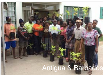
Antigua & Barbados

global food security and reforestation issues by expanding plantings of good quality breadfruit varieties in tropical regions.